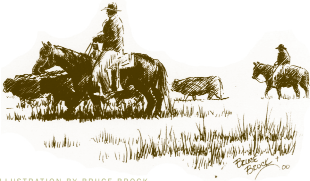
ILLUSTRATION BY BRUCE BROCK

SYMPHONY IN THE FLINT HILLS 311 Cottonwood Avenue / Strong City, KS 66869 620-273-8955 / symphonyintheflinthills.org