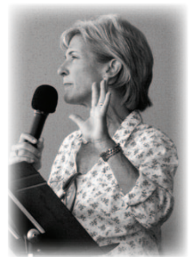
Governor Kathleen Sebelius Honorary Chair